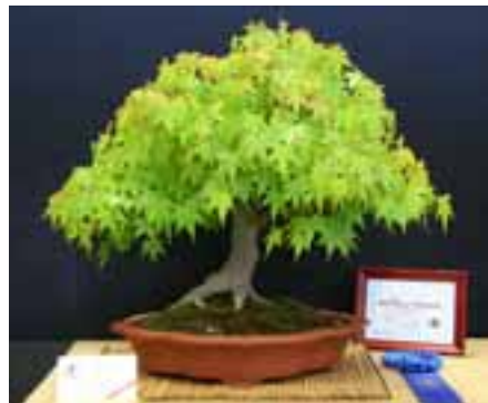
1st Place, Vance Wood Japanese Maple