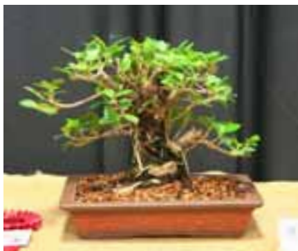
2nd Place, Todd Renshaw Green Island Fig