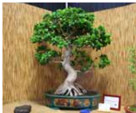
1st Place, Lamont Jackson Fig