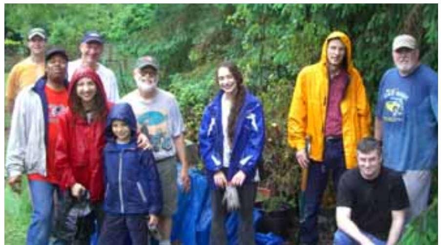
The growing bed volunteers.

If you plan to be in Chicago in mid-August, you should go see the Midwest Bonsai Show at the Chicago Botanic Gardens in Glencoe. It is the best and biggest bonsai show in the midwest. They have an amazing exhibit of trees and a great vendor area. It's a long drive to Chicago (and their traffic really stinks), but the show is worth it. More information at www.midwestbonsai.org .