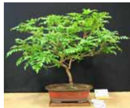
3rd Place, Lamont Jackson Cape Honeysuckle