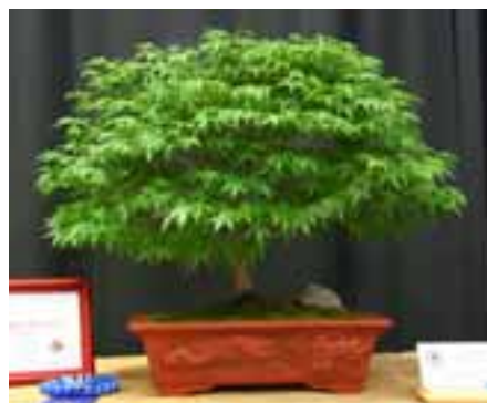
1st Place, Jim Loeffler Japanese Maple