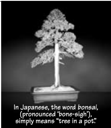
In Japanese, the word bonsai , (pronounced 'bone-sigh'), simply means "tree in a pot."