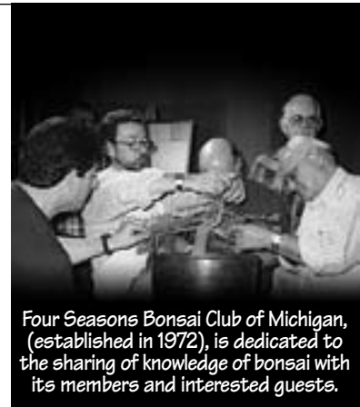
Four Seasons Bonsai Club of Michigan, (established in 1972), is dedicated to the sharing of knowledge of bonsai with its members and interested guests.

*Not held on the last Sunday of the month.